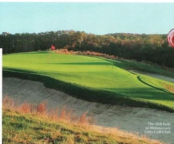
The 11th hole at Shinnecock Hills Golf Club

A Hamptons favorite, the Maidstone has picturesque bridges over the water and ocean views. Jackie Kennedy's father, John Vernou Bouvier III, was a member. "It's the hardest shortest course in America," one member says. "On a windy day, it can bite you in the ass. The tenth hole is a killer with a fast-sloped green. You could be putting for a birdie, and then suddenly be putting for a six."