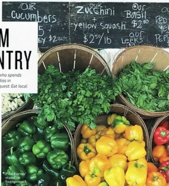
*Pike Farms' stand in Sagaponack