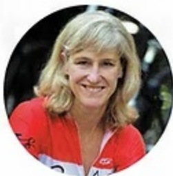
LAKE POWELL BY HOUSEBOAT