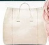
Aerin weekender bag and cashmere scarf, aerin.com