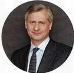
JON MEACHAM THE NASHVILLE CODE

"As corny as it sounds, Stephen King is my hero. Rarely a day goes by where I don't think about his stories," says the Pushcart Prize-winning novelist and comics writer, who pays tribute to the famed master of horror in this issue. "King's work ethic and Mad Hatter imagination inspire me at my own keyboard."