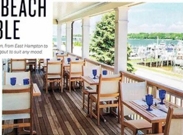
The terrace at Baron's Cove

Guests sip drinks on the Montauk beach—the only full-service shoreside resort in the Hamptons, gurneysmontauk.com