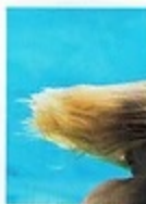
Michael Dweck's Mermaid 30 (2007)

Your photographs capture people enjoying the sand, sea, and salty air. Is the seduction of the flesh particular to Montauk? No, it's not specific to a town. My work is about summer youth and blends idealism and documentation. Your book The End: Montauk, N.Y. is more a story than pure photography. My artwork is like a film. You escape and go on a journey that idealizes surfing subculture. How has money changed Montauk? The main street still has no traffic light, and there are dunes that are still the same. The sun and water are what I come for.